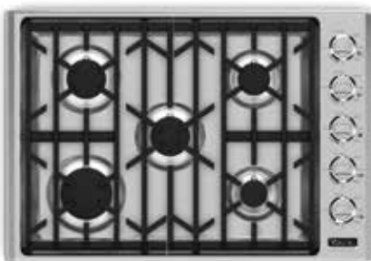
30"W. Gas Cooktop

Designed to fit virtually any existing cutout, Viking Professional Gas Cooktops offer a hassle-free kitchen upgrade with superior cooking power. These surface units strategically deliver all the power you could want from your cooktop, giving you the freedom to not only cook whatever you like, but however you like.