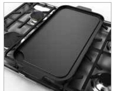
Optional Griddle Accessory